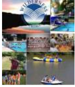
Camp Wilderness Facebook

Breaking Bread: Our next Breaking Bread is coming June 7 th , at 11:15 a.m. Stay tuned for more information.